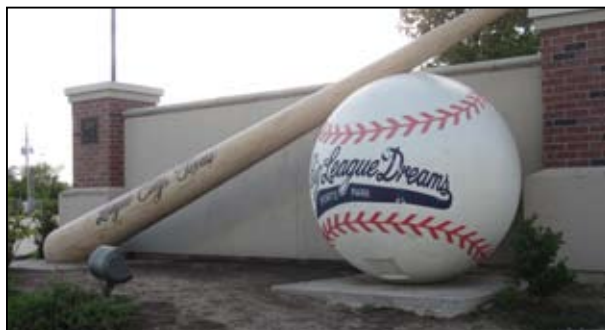
BIG LEAGUE DREAMS SPORTS PARK TEXAS CITY, TEXAS